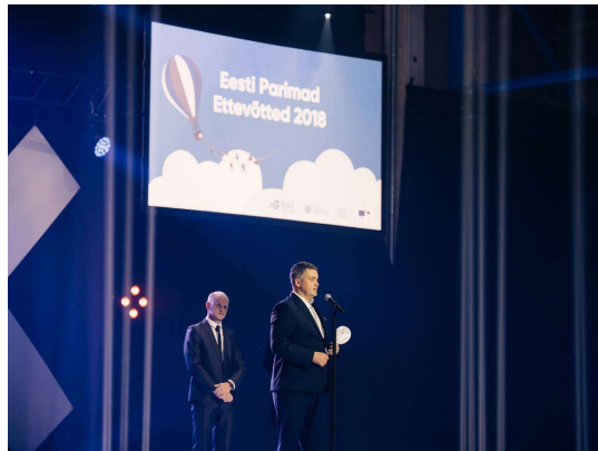
Photos: With joined team efforts, thermally modified wood reaches more than 50 countries. Thermory AS was awarded recently in Estonia by becoming “Exporter of the Year 2018”.