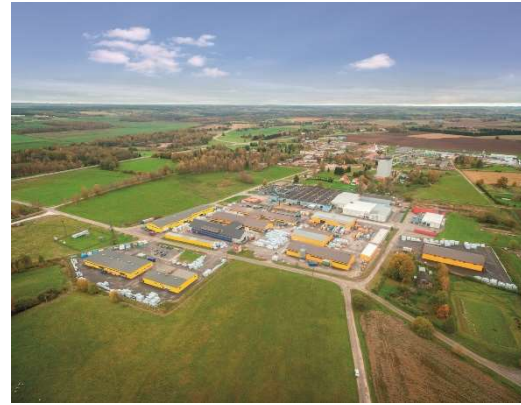
Photos: merged company Thermory AS has two production units in Estonia. In addition, the company has production unit in Finland, sawmills in Estonia and Belarus and a subsidiary company in the US.