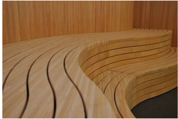
Photos: Thermory ready-made saunas are represented by brand Auroom ( www.auroomwellness.com )